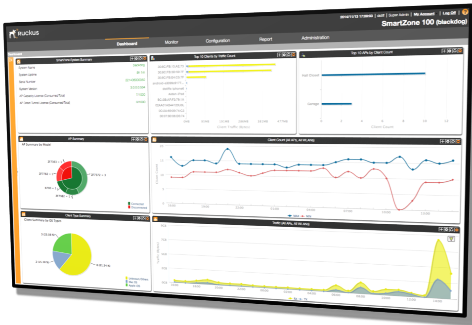
Below: The SmartZone 100 per user customizable dashboard

Ruckus Smart Mesh Networking enables self-organizing and self-healing WLAN deployment. It eliminates the need to run Ethernet cables to every AP, allowing administrators to simply plug in ZoneFlex APs to any power source and walk away. All configuration and management is delivered through the SmartZone™ 100 Smart WLAN controller. APs can also be daisy-chained to mesh APs to extend the mesh and take advantage of spatial reuse.